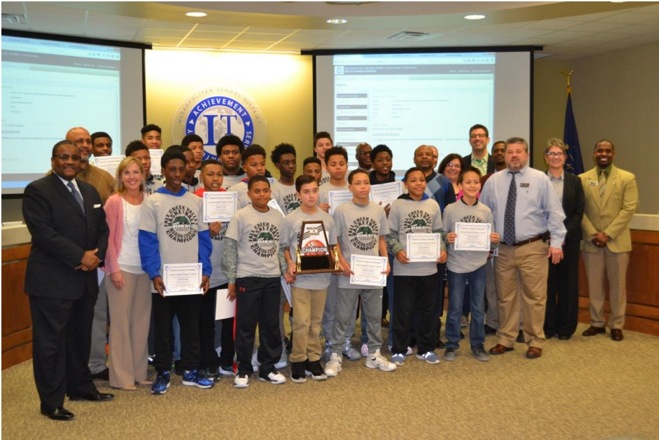
Fall Creek Valley 7 th Grade Boys' Basketball Team