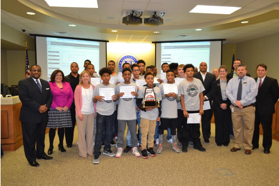
Fall Creek Valley 8 th Grade Boys' Basketball Team